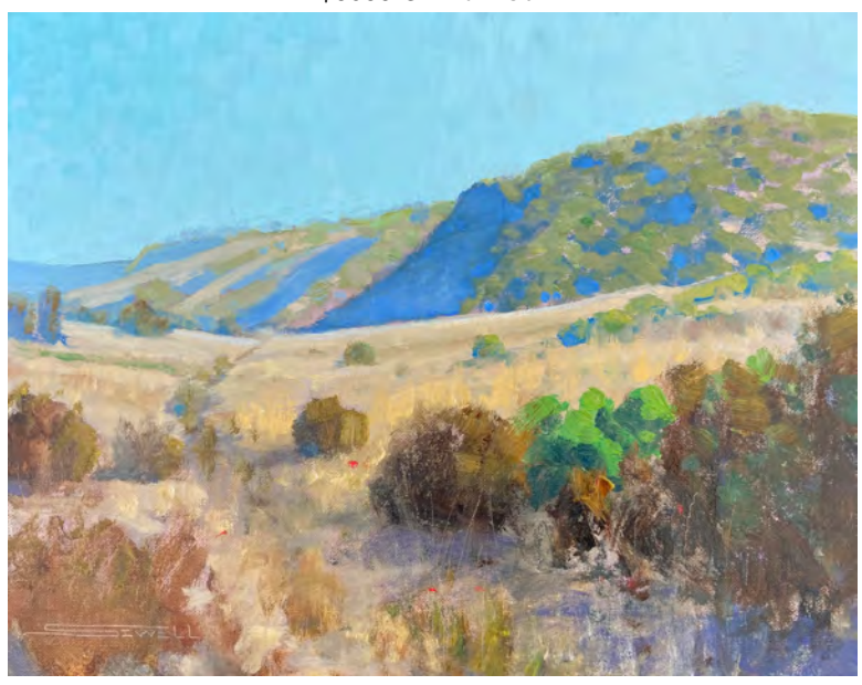
"Field Of Dreams - Aliso Canyon" 11x14 Water Mixable Oil on Linen $1050