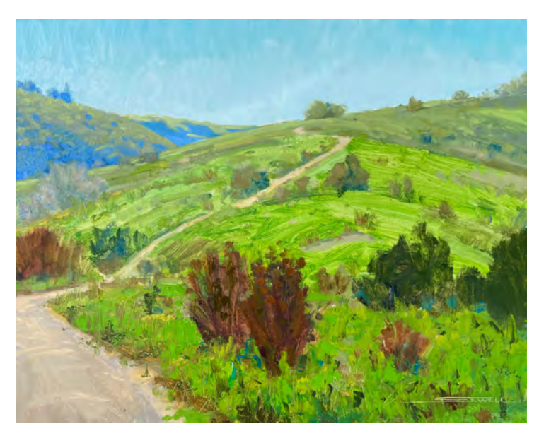
"Hierarchy of Greens - Mathis Canyon Trail" 16x20 Water Mixable Oil on Canvas $1850 Unframed