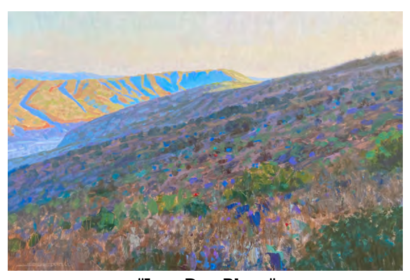
"Late Day Blues" 24x36 Water Mixable Oil and Acrylic on Canvas $3200