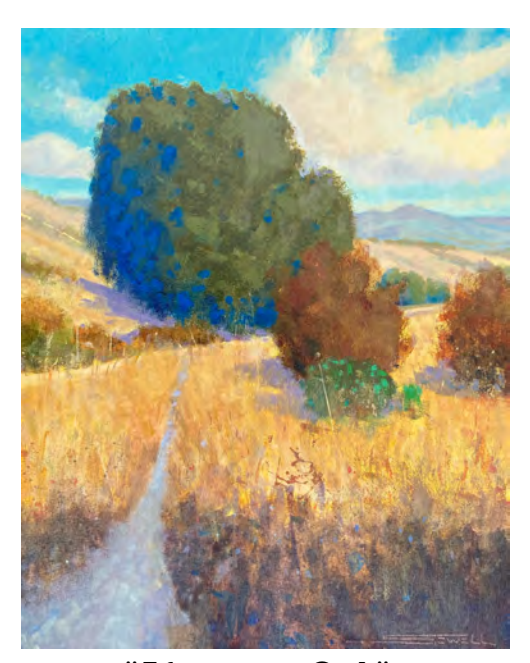
"Afternoon Oak" 20x16 Water Mixable Oil and Acrylic on Canvas $1850 Unframed