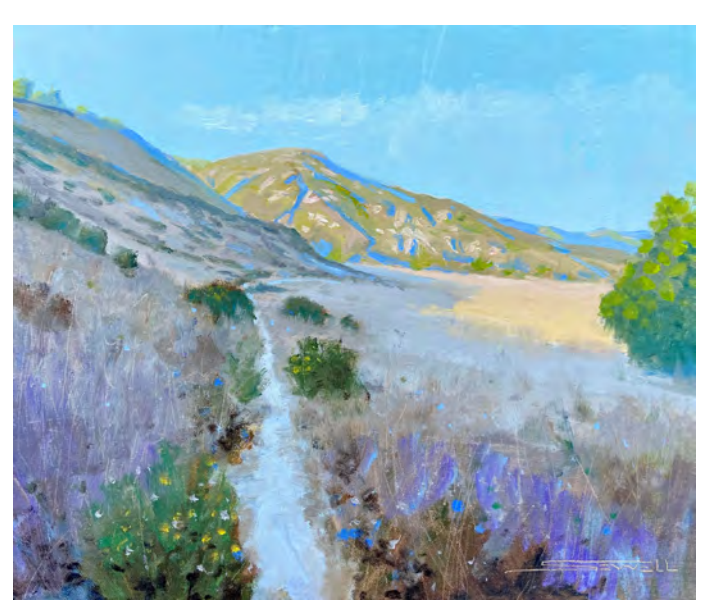
"Peace In The Meadows - Moulton Meadows" 13x15 Water Mixable Oil on Canvas SOLD $1550