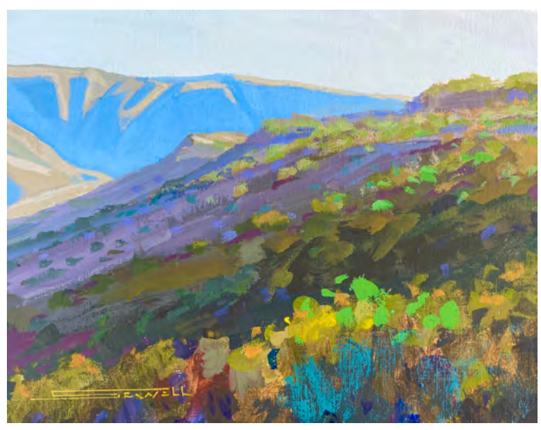
"Study For Late Day Blues" 8x10 Gouache on Card $800