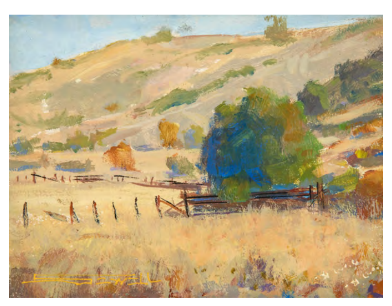
"Corral Shadetree" 6x8 Gouache on Card $575