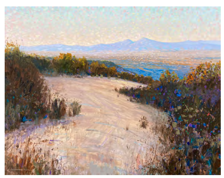
"Evening Presence - View from Moulton Park" Oil on Canvas $4,200 On exhibit at John Wayne Airport March 23, 2023 to September 18, 2023

Phone: 949-8-MUSEUM info@moultonmuseum.org Social Media @MoultonMuseum