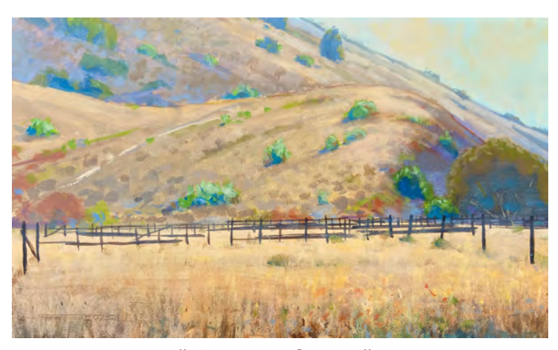
"Morning Corral" 12x20 Water Mixable Oil and Acrylic on Board $2000