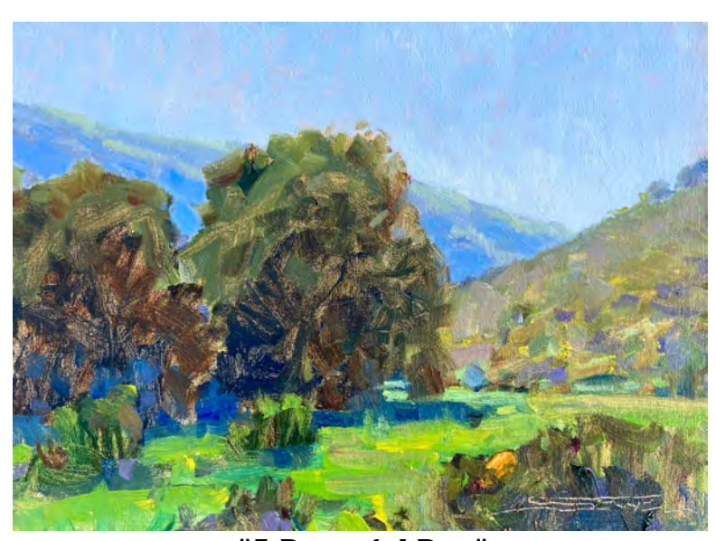
"A Peaceful Day" 9x12 Water Mixable Oil on Canvas$875