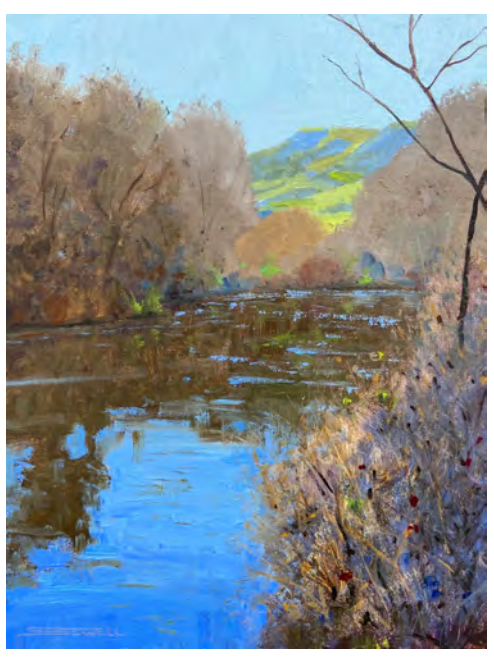
"Aliso Creek" 18x14 Water Mixable Oil on Canvas$1750 Unframed