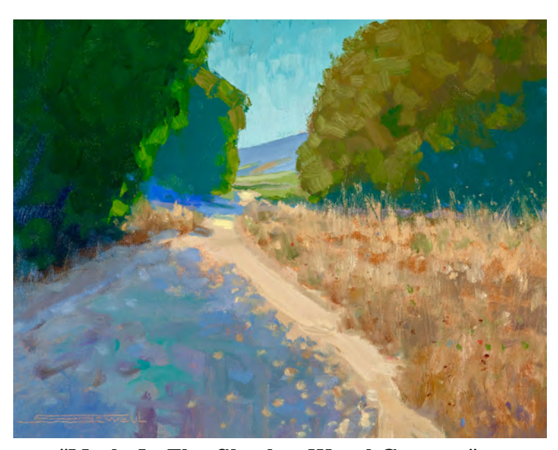
"Made In The Shade - Wood Canyon" 11x14 Water Mixable Oil $1050