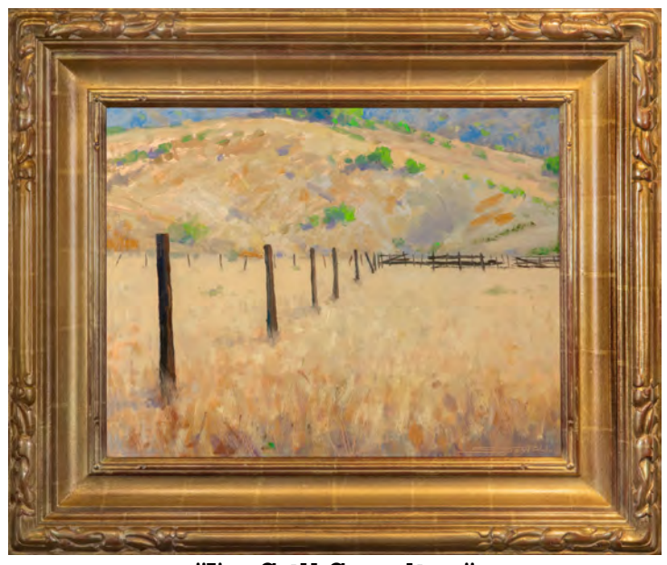
"I'm Still Standing"

18x24 Water Mixable Oil on Canvas $1950 Unframed - $2950 with Frame Shown in Mayen Olson Frame