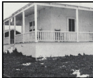
The White Swan