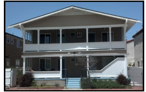
117 Turquoise, Historic Plaque date 1912

There are 1,444 homes on Balboa Island, and out of these, 135 bear a plaque engraved with the words Balboa Island Historical Society and the date that the house was built. About 300 more houses qualify to be recognized as a "historic home" and the BI Museum & Historical Society invites home owners to consider purchasing a plaque. In order to qualify, the structure must have been constructed at least 60 years ago (currently 1954 or earlier.)